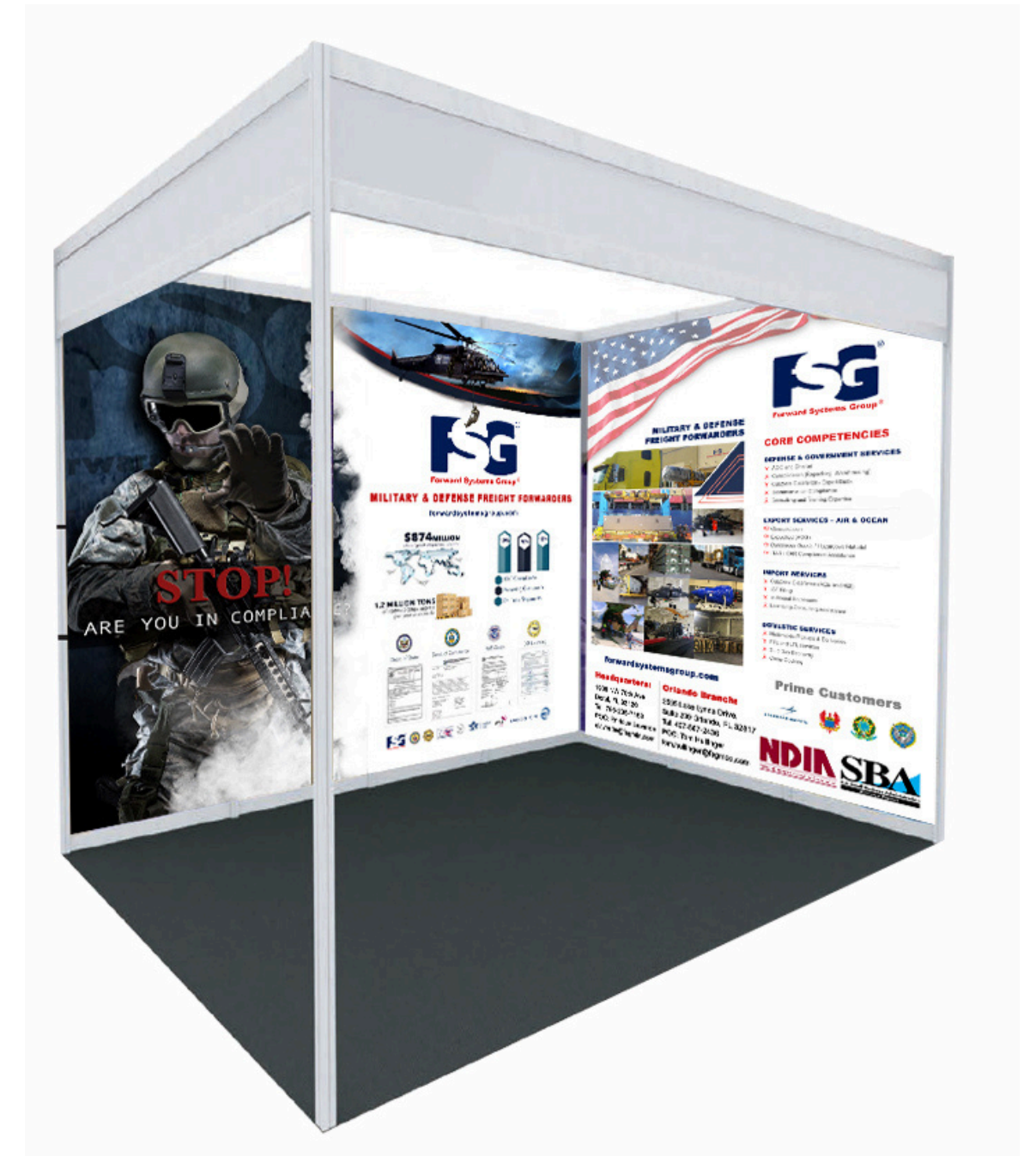
• DSEI - LONDON, UK