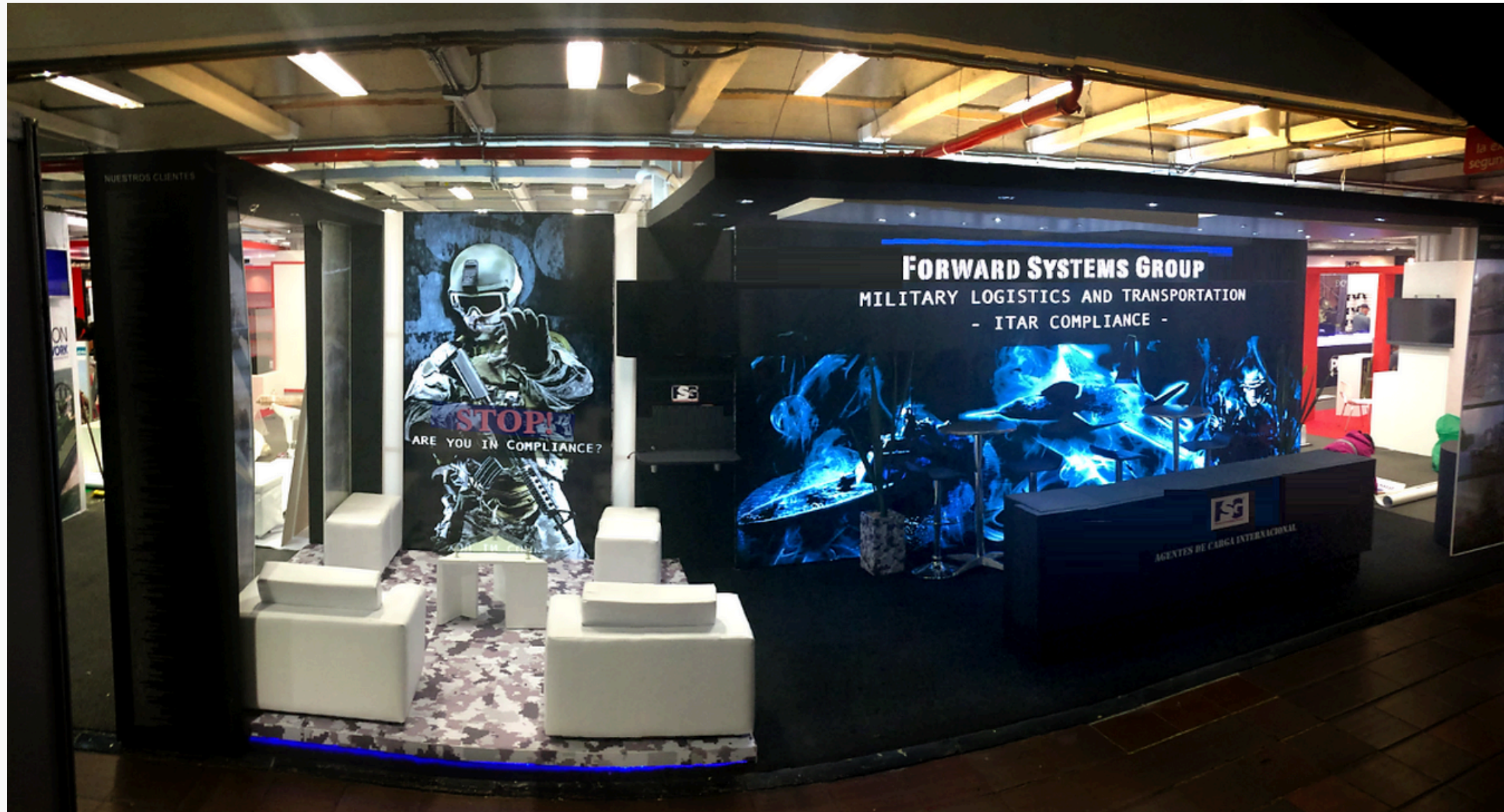
• EXPODEFENSA - COLOMBIA