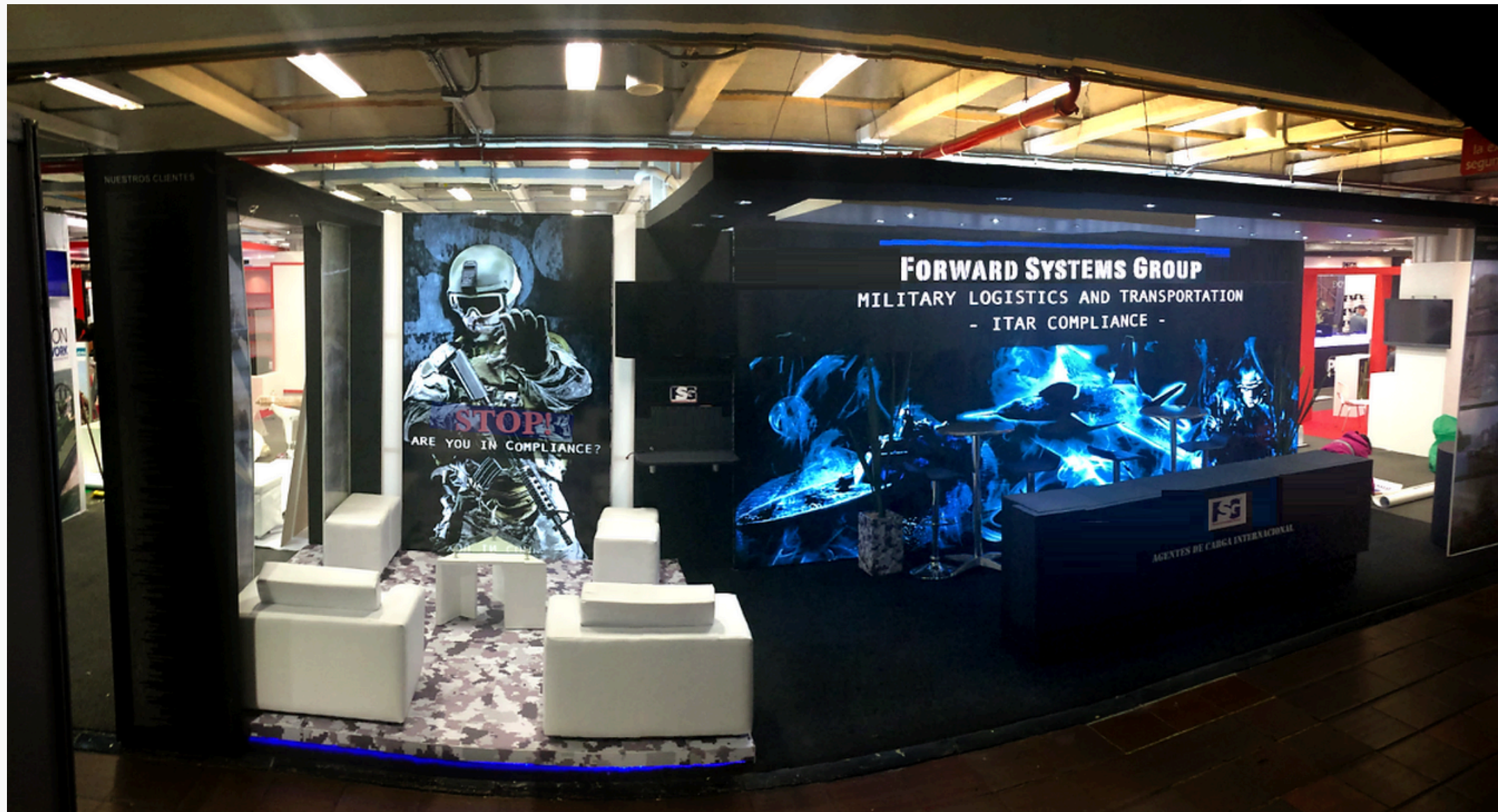
• EXPODEFENSA - COLOMBIA